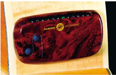
AX2000W is available in 3 wood tones – burl (shown), rosewood, and teak.

For more information visit Sabine.com or call 800-626-7394 for individual product brochures.