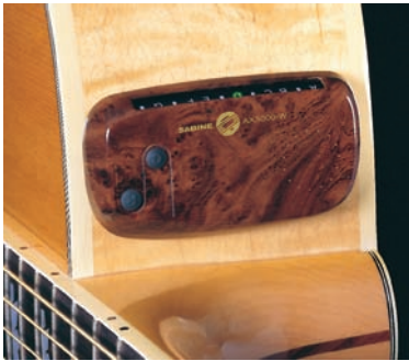
AX3000-W in burl wood finish